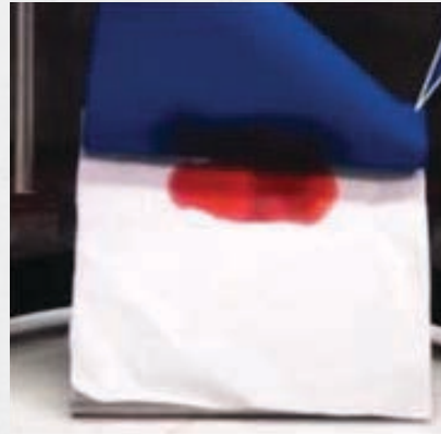
Regular FR Lab Coat